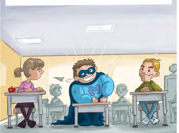
A SUPERHERO MUST ALWAYS MAINTAIN SELF-CONTROL, EVEN WHEN IT HURTS.